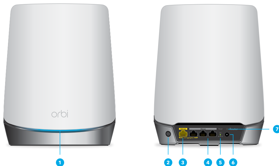
Figure 1. Orbi router front and back views

The following figures shows the Orbi router hardware features.