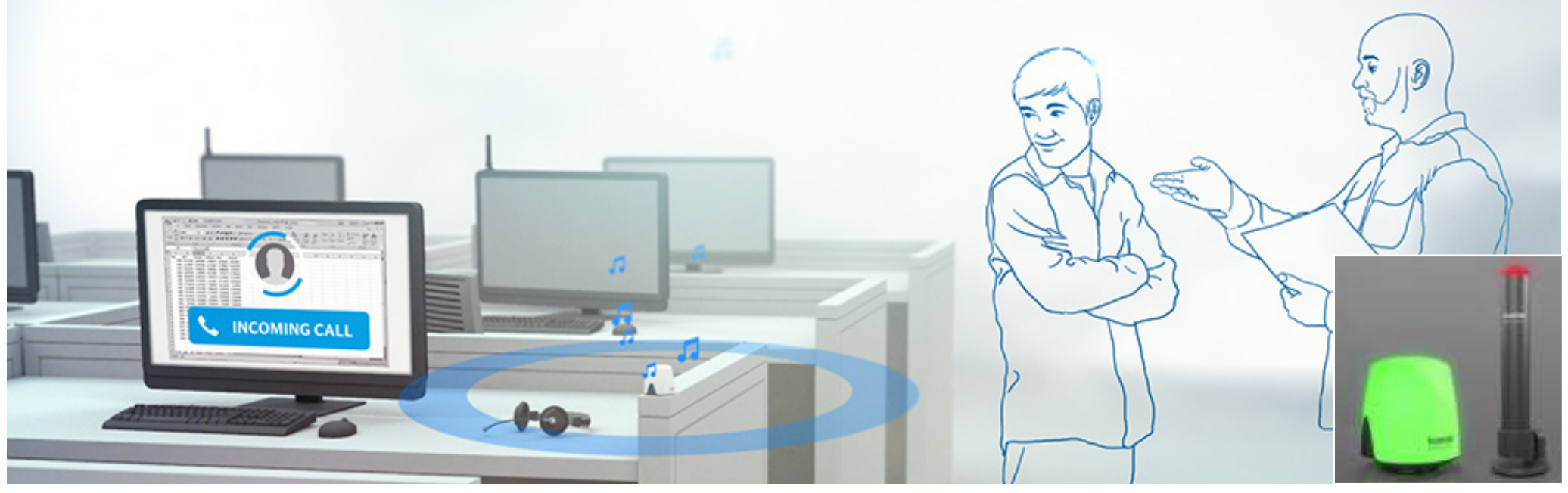
kuando Busylight UC.