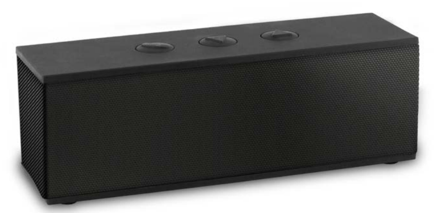
PLEASE READ THIS OPERATING MANUAL COMPLETELY BEFORE OPERATING THIS UNIT AND RETAIN IT FOR FUTURE REFERENCE.