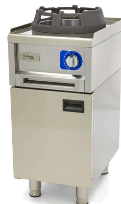
Easy to combine with a 600 series chassis