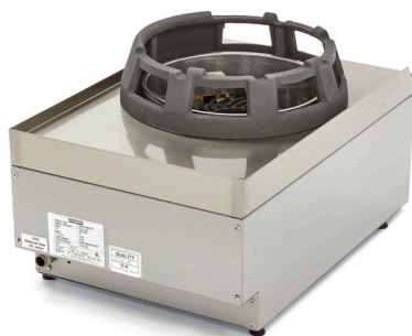
Durable and strong cast iron cooking ring