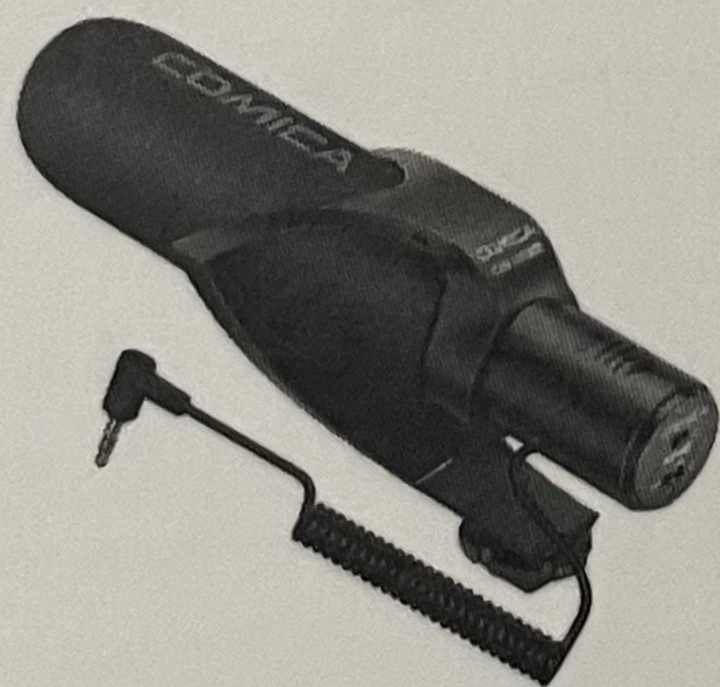
Mic Body (Including Windscreen)