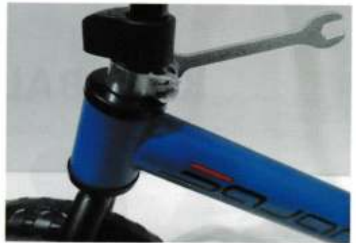
2. Tight the clamp.