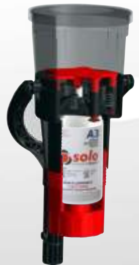
Solo 330 for use with Solo A3 & C3 Aerosols

Solo 332 is available for larger diameter detectors.