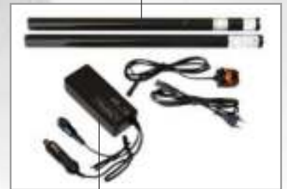
Solo 726 Fast Charger