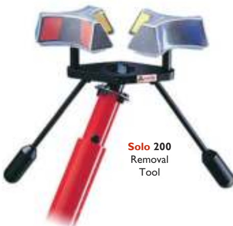
Solo 200 Removal Tool