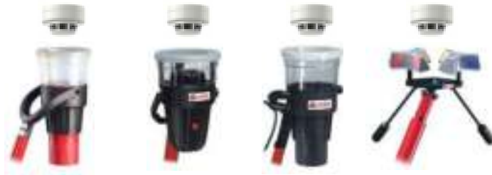
Solo 330 Aerosol Dispenser