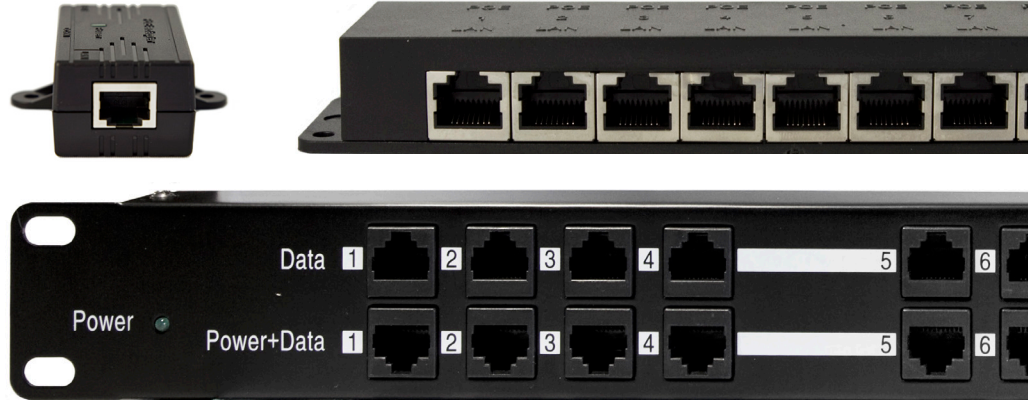
Clockwise from top left: single-port PoE injector; 8-port PoE injector; 12-port rack-mounted PoE injector.

Note: OM2P access points are not compatible with 48v PoE switches. Using a PoE switch or any power supply with more than 24v will void the warranty.