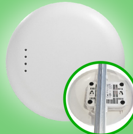
Indoor Ceiling Enclosure