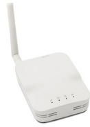
OM2P External Antenna