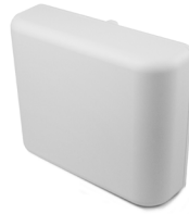
Indoor Wall Plug NOT FOR EUROPE