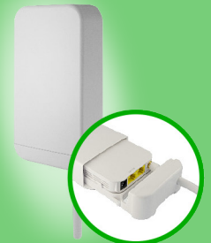
Outdoor Wall/Pole Enclosure