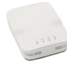
OM2P-HS High Speed, Long Range