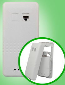
Indoor Ethernet Jack Enclosure