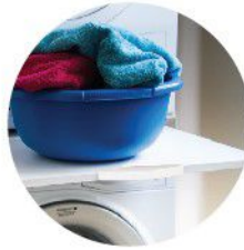
For Holding Objects

6m length to bind your appliances for extra safety