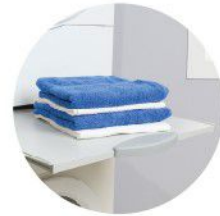
For Folding Clothes