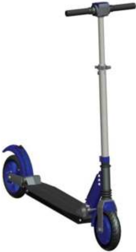
A – unfolded