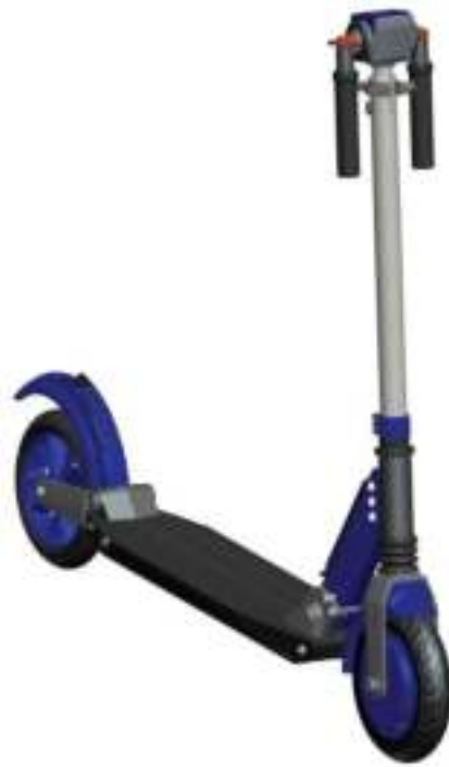
B - folding handlebars