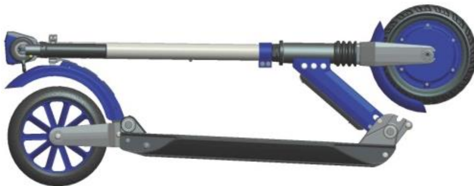
C - fully folded