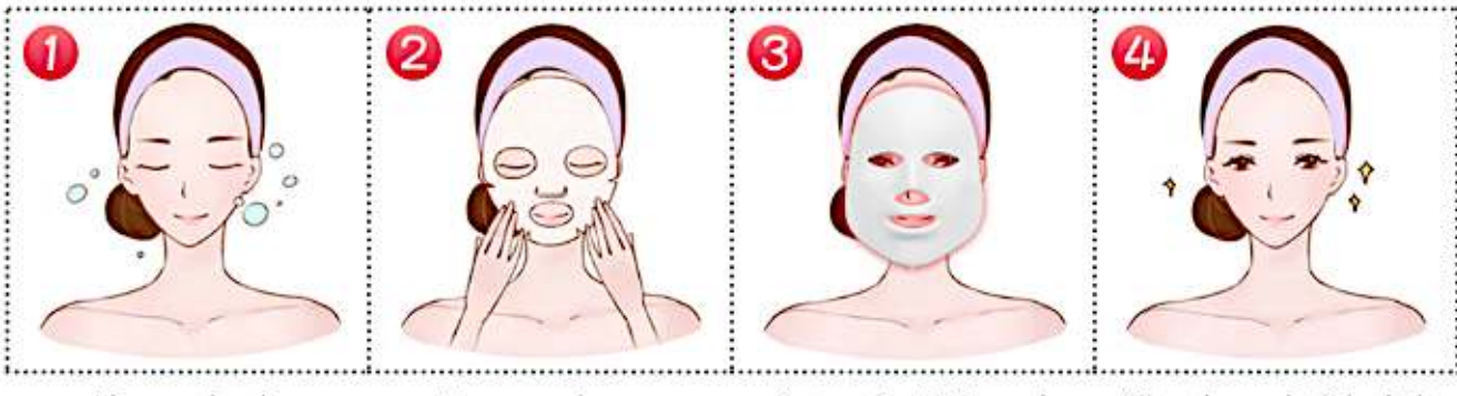
Cleanse the skin and keep the skin clean

Note: If you want the mask effect better, we suggest you use professional relational skin care product at the same time , the led light will promote the assimilate of skin care product, Enhances the efficacy of skin care product , then has better effect ,and it will not immediately see the effect ,it need some time to repair you skin,so keep use it and be patient.