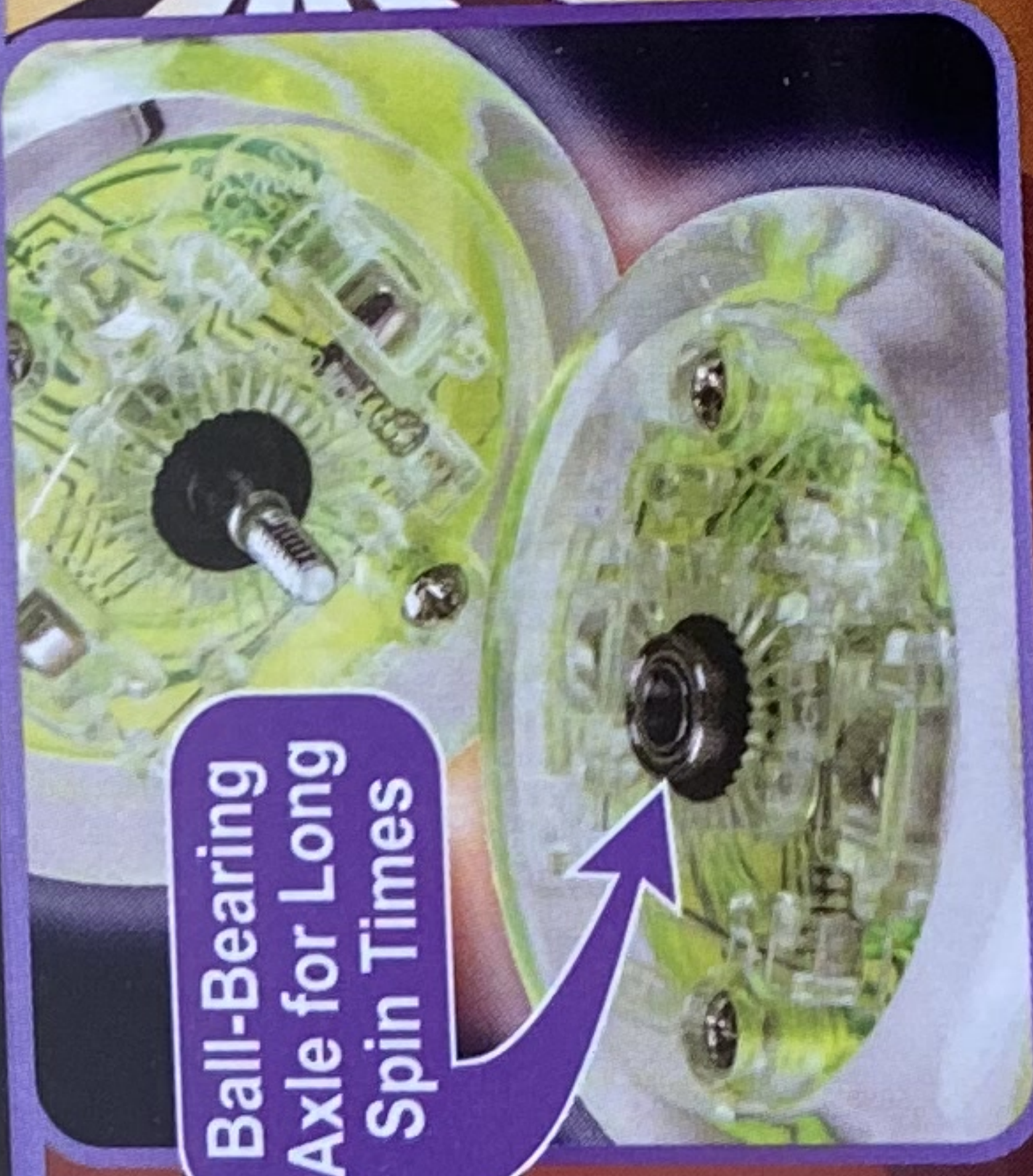
Ball-Bearing Axle for Long Spin Times