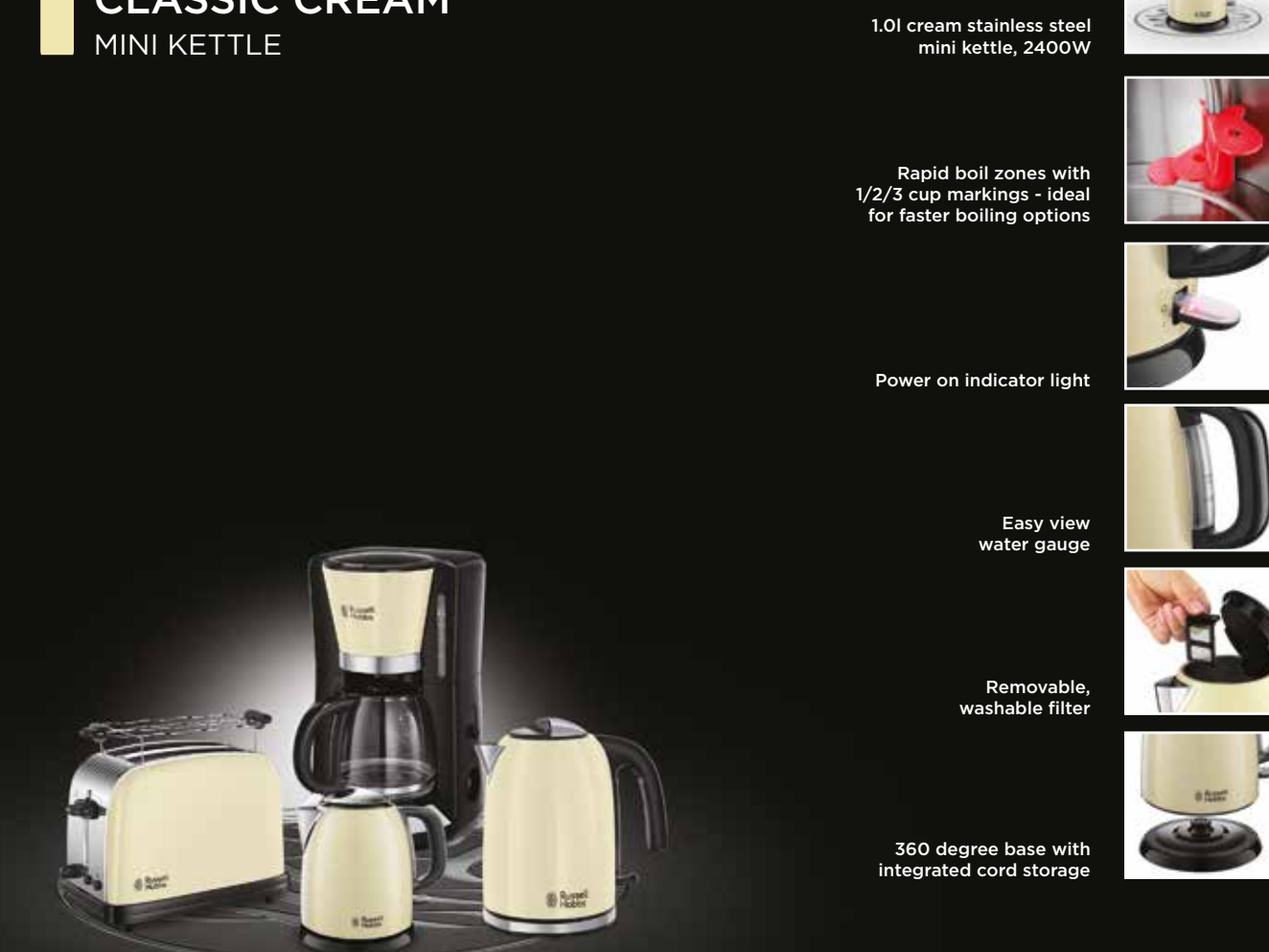
1.0l cream stainless steel mini kettle, 2400W