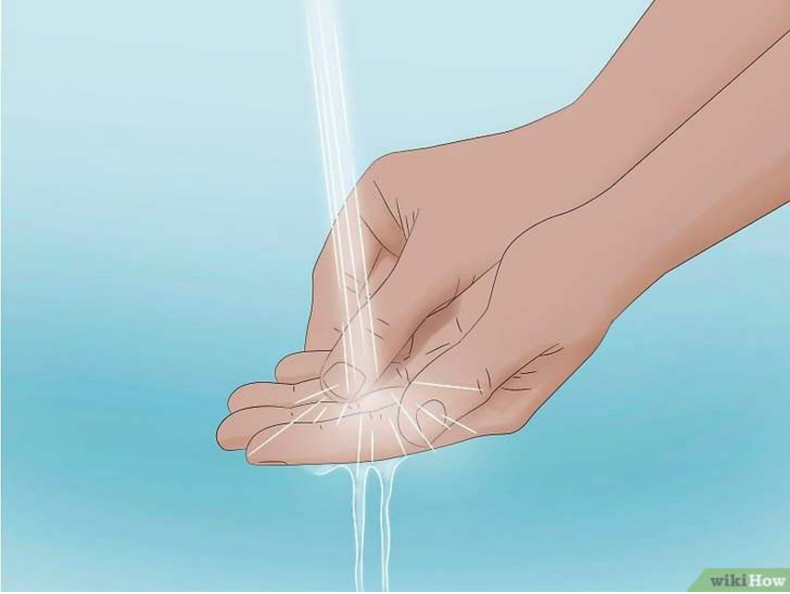
1. Wash your hands.