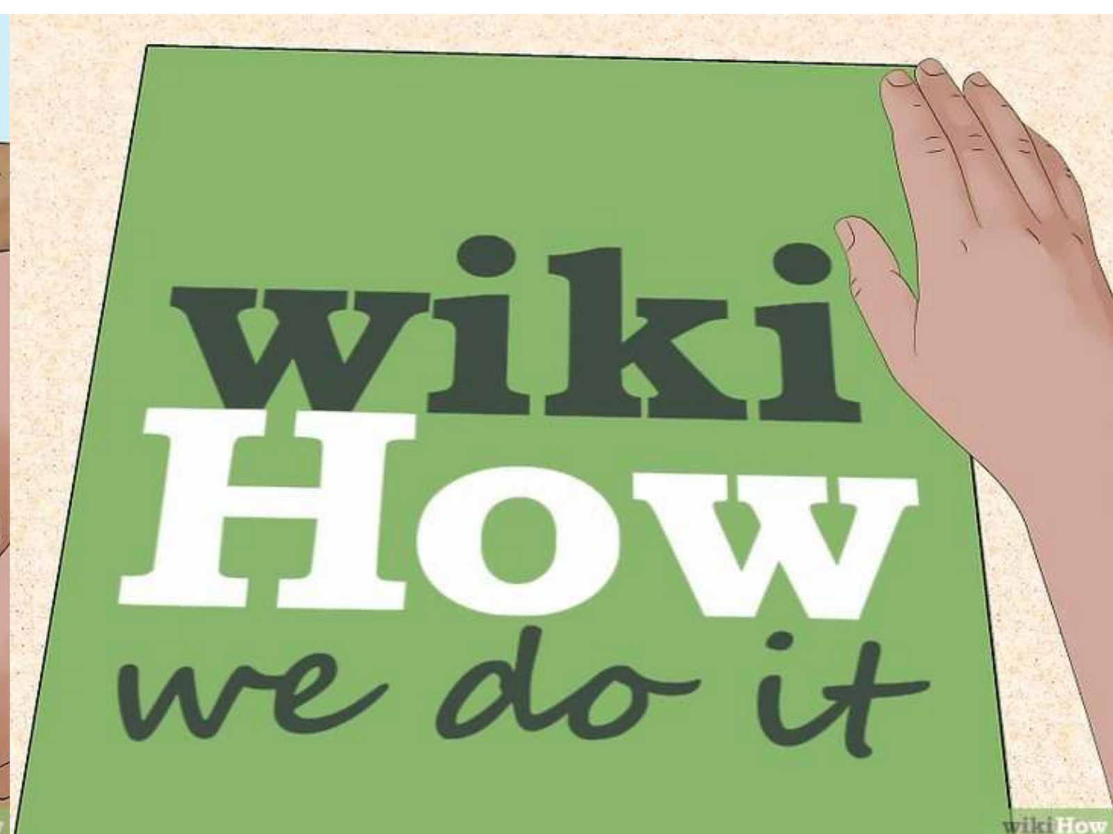
6. Apply poster on wall