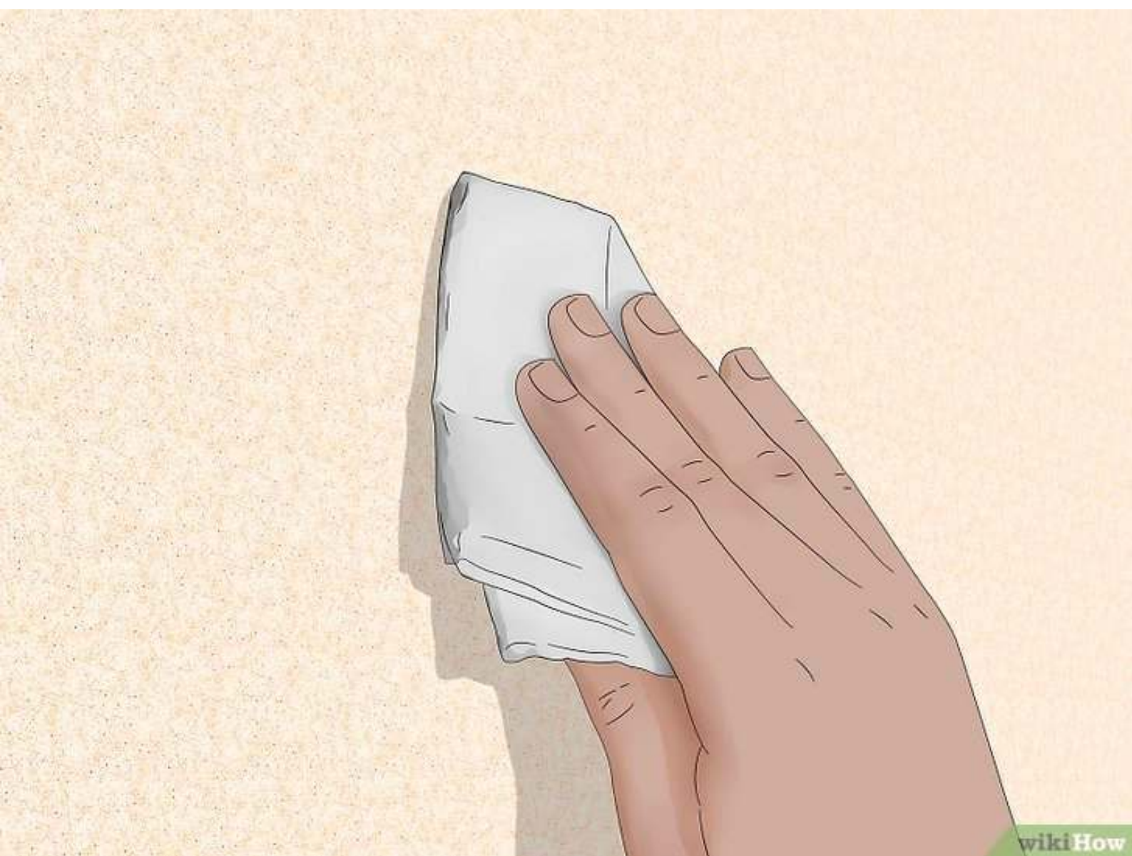
3. Clean the wall surface .