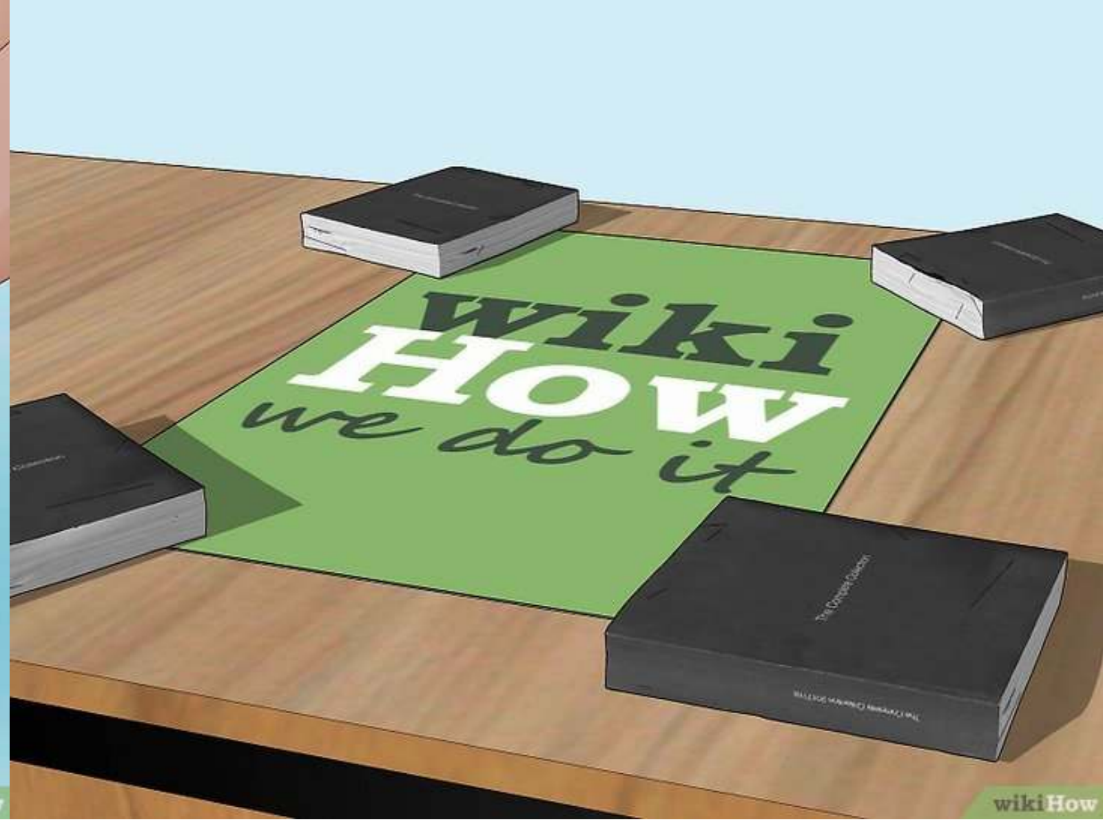
2. Stretch out the poster.