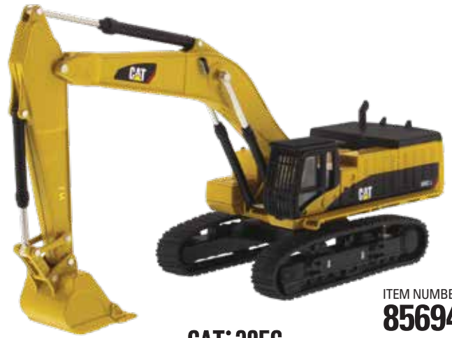
CAT® 385C HYDRAULIC EXCAVATOR