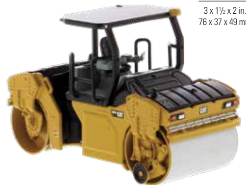
CAT® CB-13 TANDEM VIBRATORY ROLLER WITH ROPS