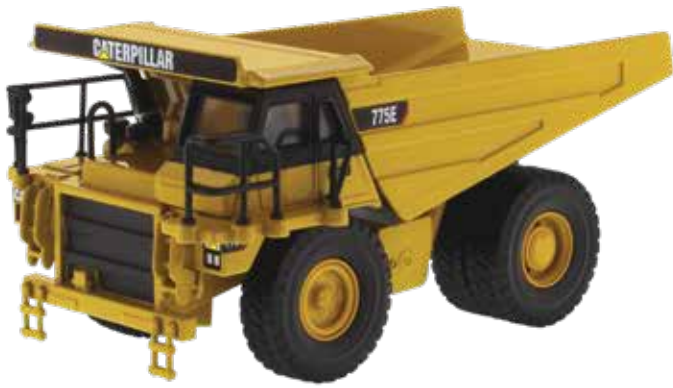
CAT® 775E OFF-HIGHWAY TRUCK