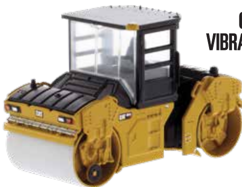
CAT® CB-13 TANDEM VIBRATORY ROLLER WITH CAB