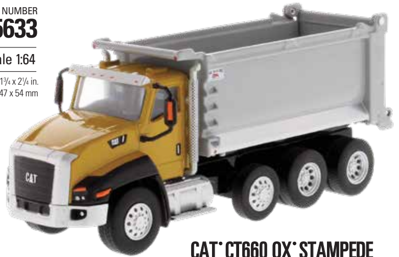
CAT® CT660 OX® STAMPEDE DUMP-TRUCK

5 in X 1 1/4 x 2 1/4 in. 128 x 47 x 54 mm