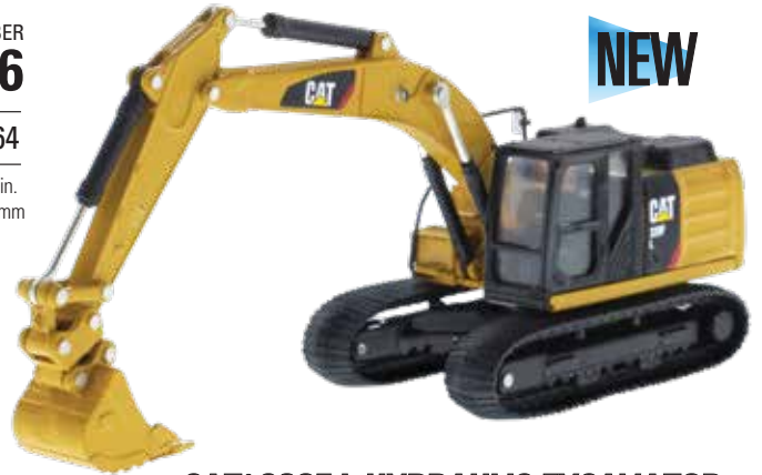
CAT ® 320F L HYDRAULIC EXCAVATOR WITH WORK TOOLS