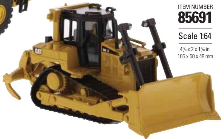
CAT® D6R TRACK-TYPE TRACTOR