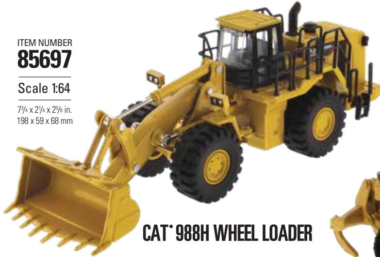
CAT® 988H WHEEL LOADER