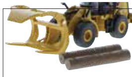
LOG FORK WITH POLES