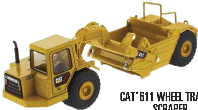
CAT® 611 WHEEL TRACTOR SCRAPER