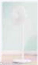
Imagen en color del producto: