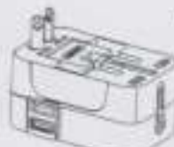
Australian / Chinese Type