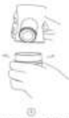
4 Unscrew the water tank.