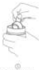
5 Remove the scoop from the water tank.