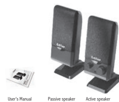
User's Manual Passive speaker Active speaker