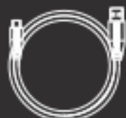
24in USB-A to USB-C Cable