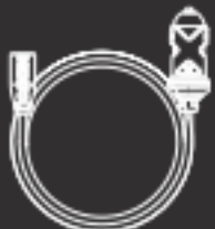
24in (0.6m) 12V to USB-C Cable