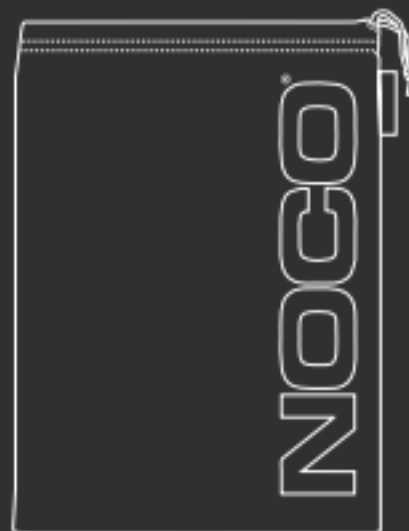
Microfiber Storage Bag