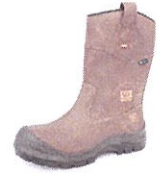
RIGGER BOOT COLTON S3