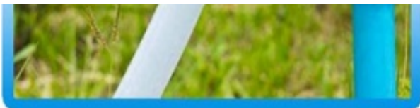
3 Connect the water hose