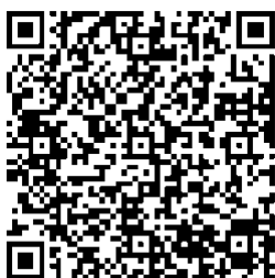
(Android QR Code)