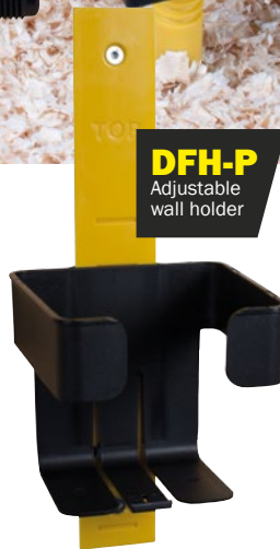
DFH-P Adjustable wall holder