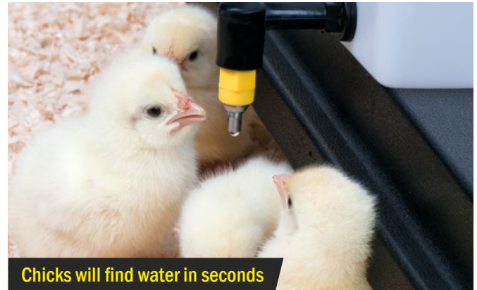
Chicks will find water in seconds