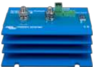
Smart BatteryProtect BP-220