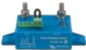
Smart BatteryProtect BP-65