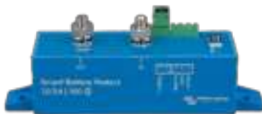
Smart BatteryProtect BP-100