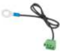
Connector with preassembled DC minus cable (included)