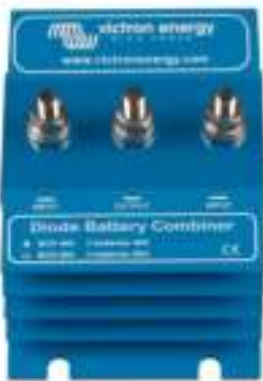
Argo Diode Battery Combiner BCD 802

Diode Battery Combiners are used to guarantee continuous DC power to mission critical equipment, such as an electronic engine control system. With a diode battery combiner two or more DC power sources can be used in parallel to supply the mission critical load. Failure of one source will not interrupt power to the critical load.