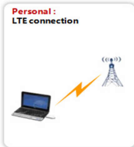
Figure 3-1 shows the device connecting to the network by USB.

After you connect the E8372 to a PC with the USB interface, you can send or receive E-mail, access the network through wireless connection, and download files through wireless data channels.