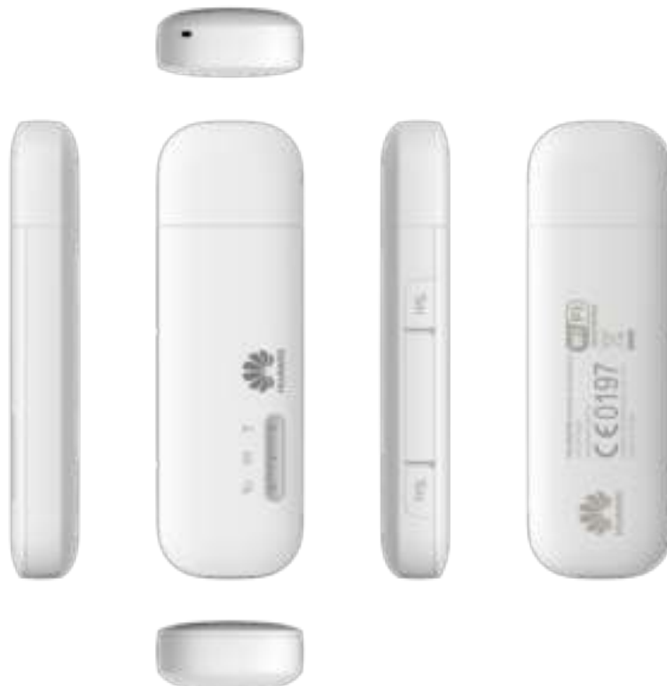
Figure 1-1 E8372 profile

Figure 1-1 shows the profile of the E8372.