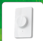
Bluetooth® mesh HBT-Dimmer switch (sold separately)