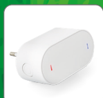
HBT-Gateway for an optimal user experience (sold separately)

Functions include: Change color, brightness or set scenes, time schedules via the Caliber SmartHome app. Cool/Warm white and full RGB color. Voice control works with 'Hey Google', 'Amazon Alexa' or 'Hey Siri'.