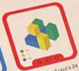
Two-sided red card x 24