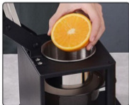
3. Put In The Cut Fruit