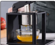
4. Squeeze The Juice And Enjoy The Delicious