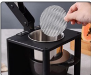
2. Put In The Dense Hole Filter