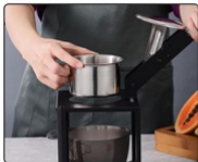
1. Install The Inner Tank First