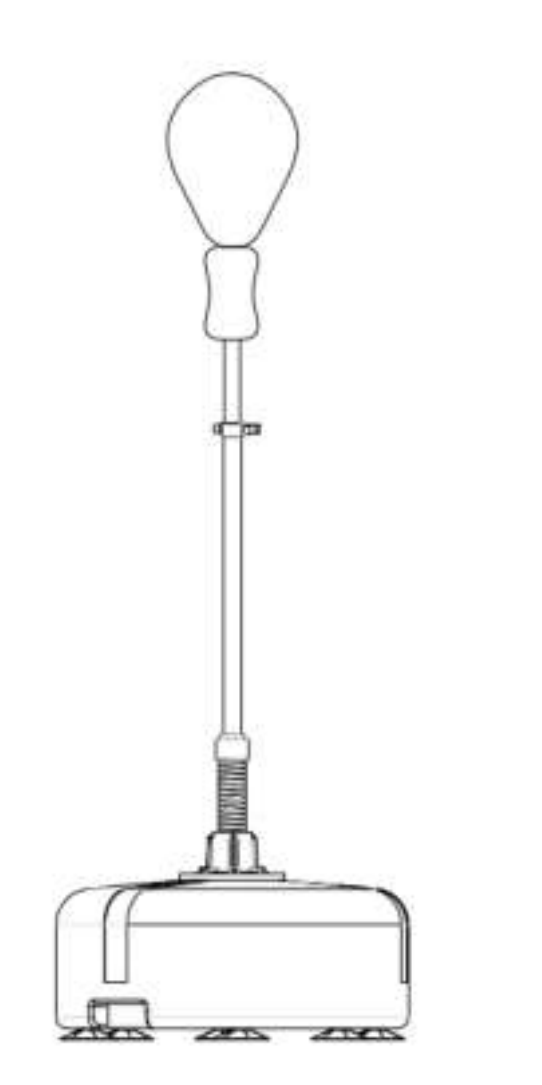
***please be careful for the bouncing of spring to avoid injury***