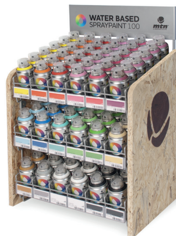
DISPLAY RACK 100 ml Height / Width / Depth 18.9 x 15,6 x 126 in. Capacity: 108 sprays. References: 16 +2 SPAT2419