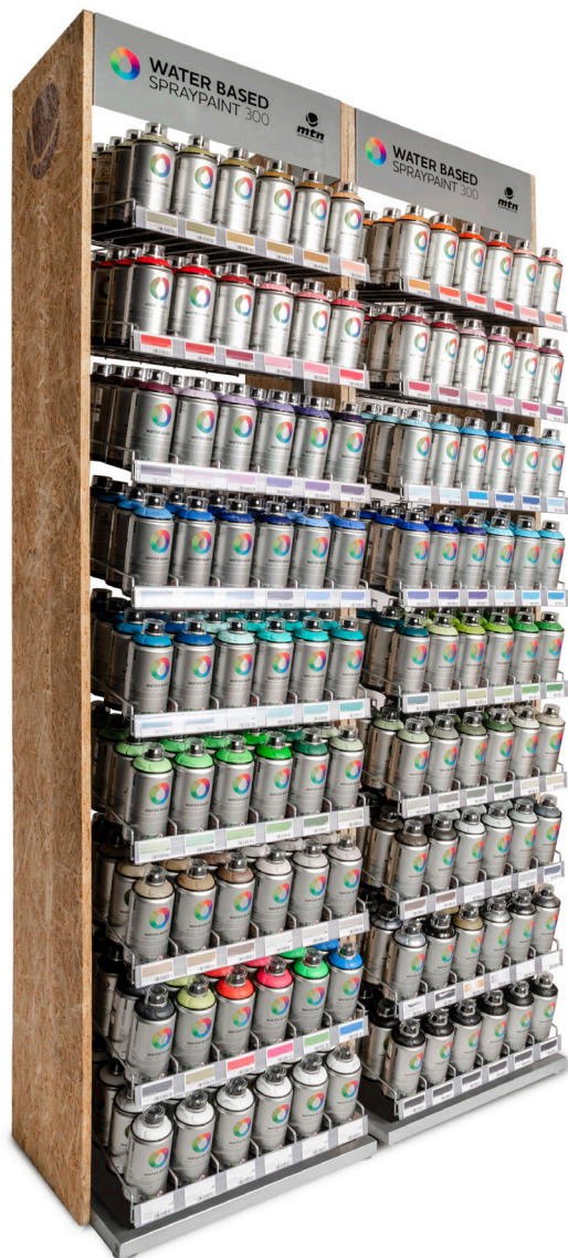
DISPLAY RACK 300 ml Height / Width / Depth 80,7 x 20,1 x 16,9 inches Capacity: 324 sprays. References: 52 + 2. SPAT2405024