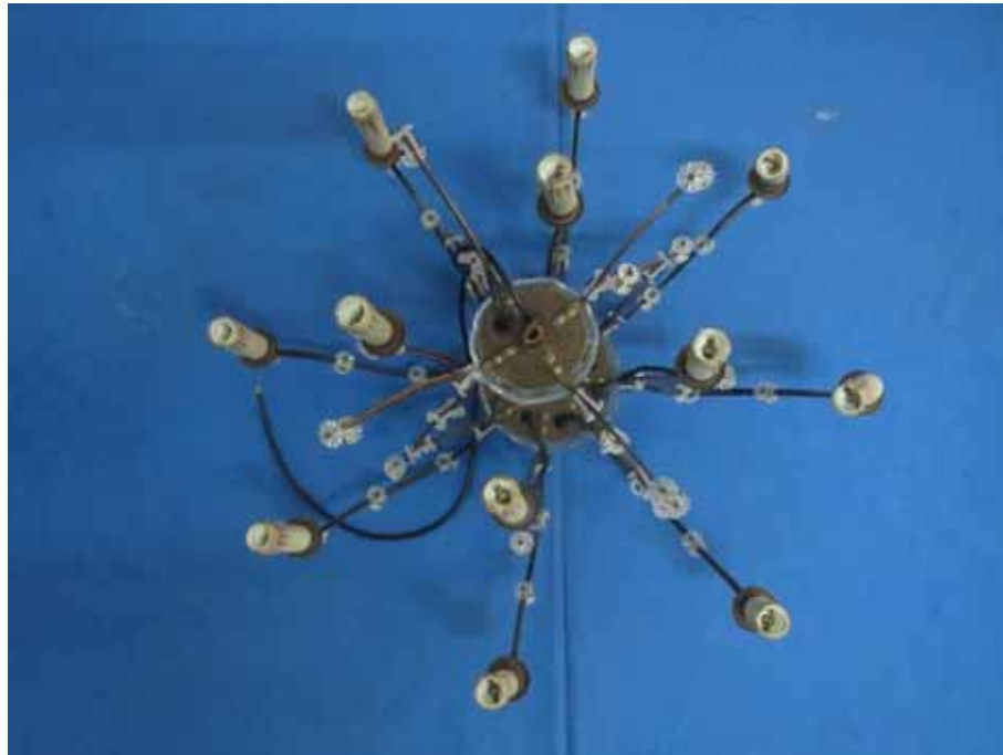
Photo 1 General Appearance of the EUT