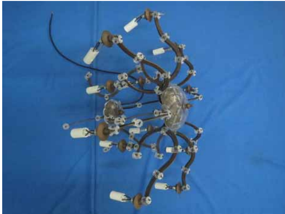
Photo 3 General Appearance of the EUT