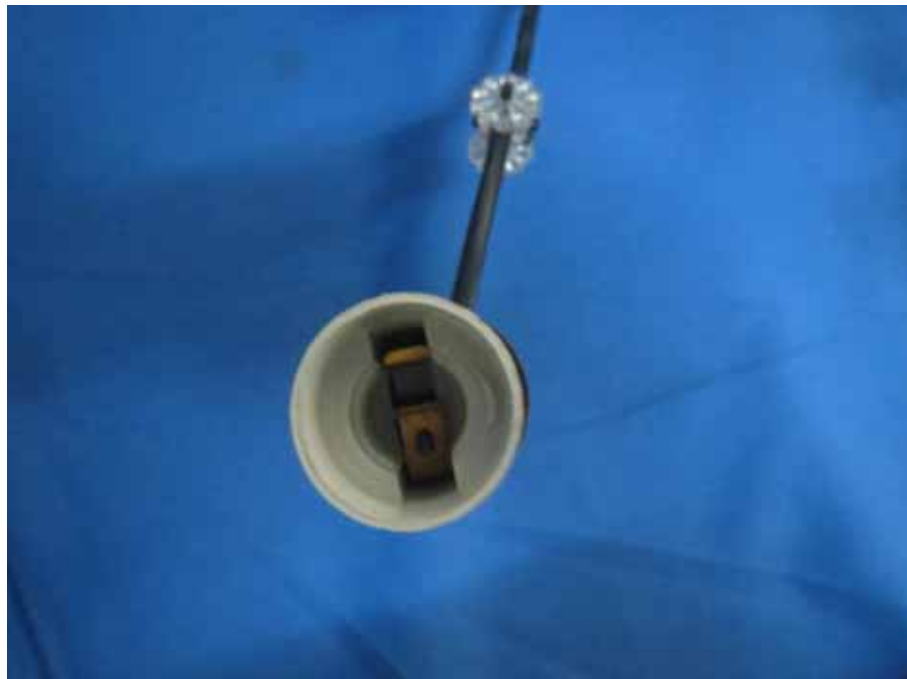
Photo 4 Lamp holder view of the EUT