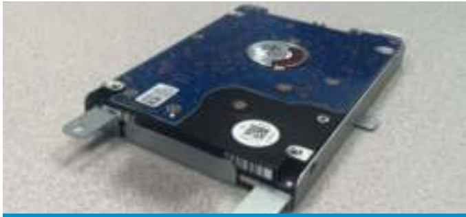
Brackets, adapters, support frames, braces, pull tabs, or screws

When you first slot your SSD into the storage drive bay, it might not fit securely. If this occurs, here's what to do based on the type of system you're installing into.