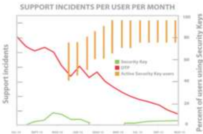
This graph illustrates how quickly Google reduced password support incidents after switching from OTP to YubiKey. 4