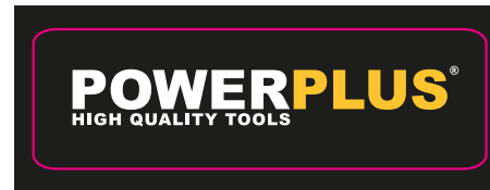
Battery base label