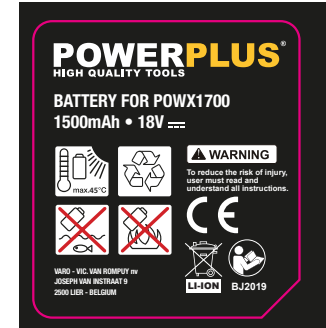
Battery bottom label