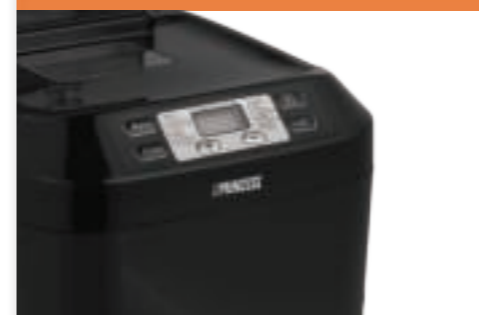
Including timer function, adjustable settings and baking programs