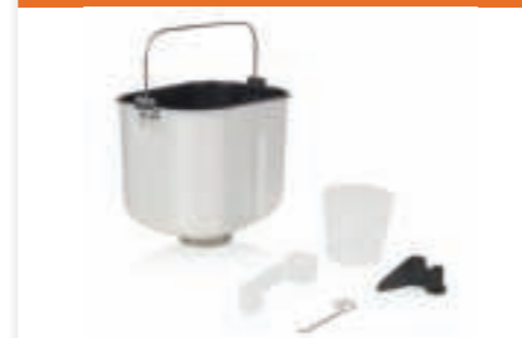
Suitable for both 700 and 900 grams of bread