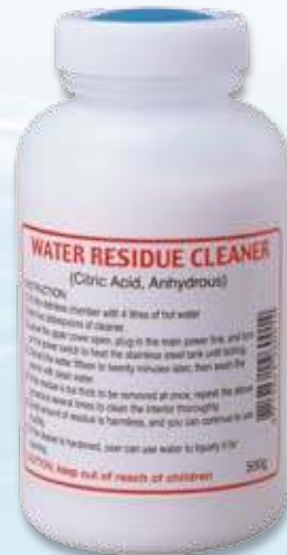
A bottle of 500 gram cleaner