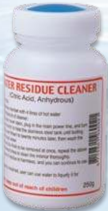
A bottle of 250 gram cleaner