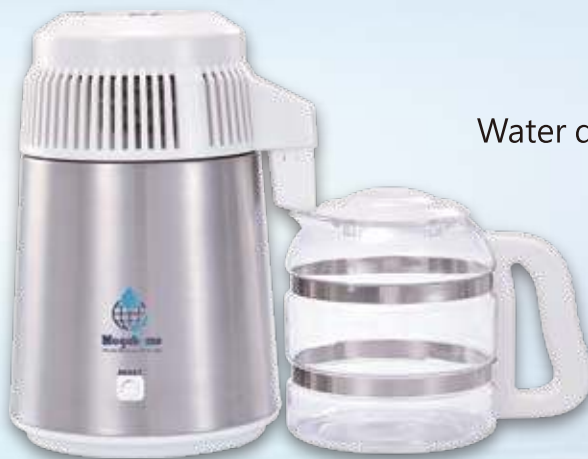
Water distiller + glass bottle

Please make sure the nozzle and the spout of water container (PP bottle or Glass bottle) are properly aligned to avoid water leaking.