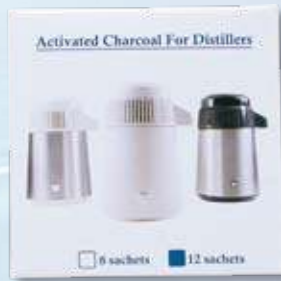
A package of 12 sachets

※ Used activated charcoal sachet can be re-used for odor removal by placing it in shoes or refrigerator.