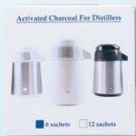
A package of 6 activated charcoal sachets