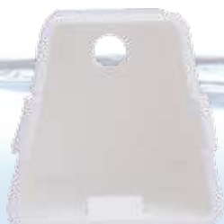
PP Nozzle (For PP bottle)