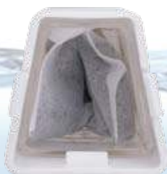
PP Nozzle + Glass Insert (For Glass bottle)