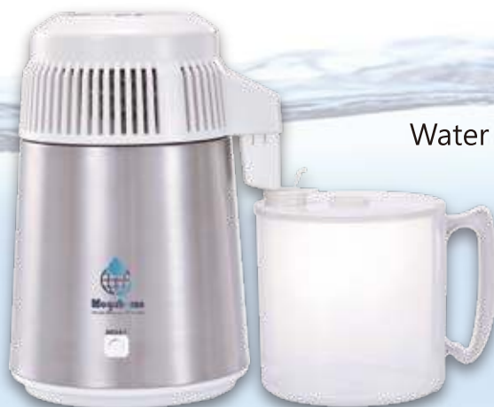
Water distiller + PP bottle