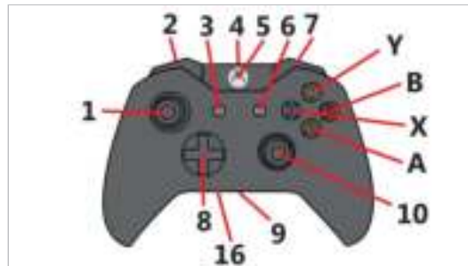
Original Xbox One Wireless Controller