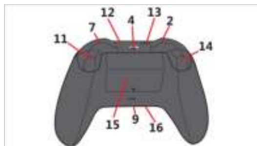
Original Xbox One Wireless Controller