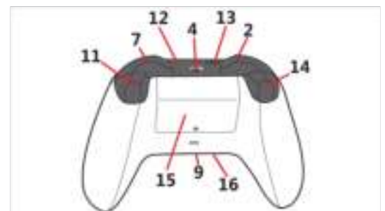
Xbox One Wireless Controller