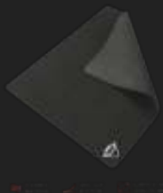
PRODUCT ESHOT 1