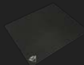
PRODUCT VISUAL 2