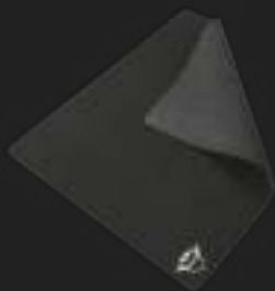
PRODUCT VISUAL 1