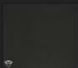
PRODUCT TOP 1