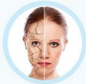
Air Conditioning Water Evaporation, Fine Lines