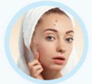
Using Computer Oil Skin, Acne