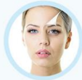
Air pollution Clogged Pores, Loose Skin