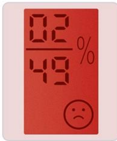
Dry (Red Light)