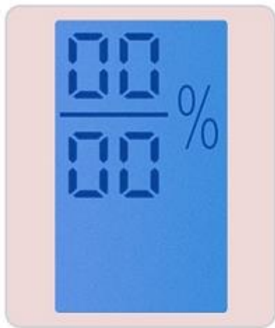
Open (Blue Light)