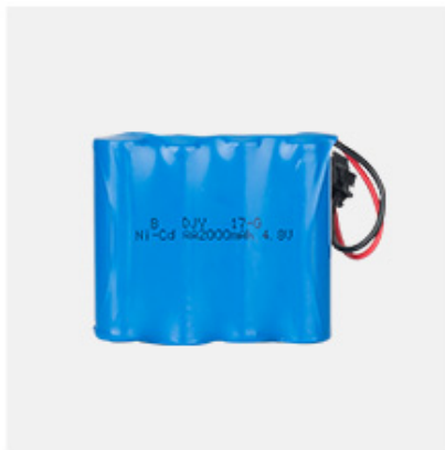
4.8V battery pack