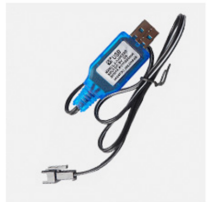
USB charging cable