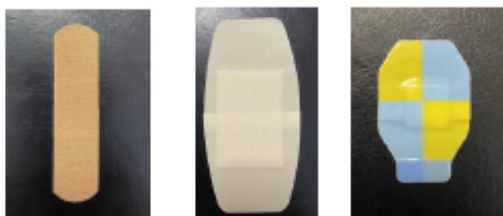
A- Elastic fabric