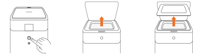
1. Turn off the power 2. Open the cover 3. Remove the packing gland