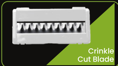
Crinkle Cut Blade