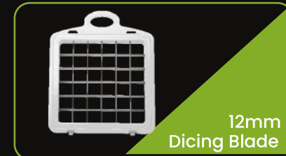
12mm Dicing Blade