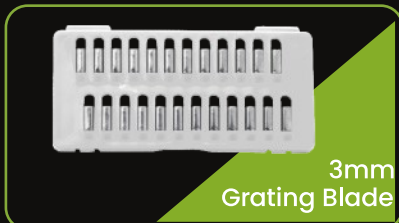
3mm Grating Blade