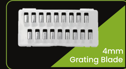
4mm Grating Blade