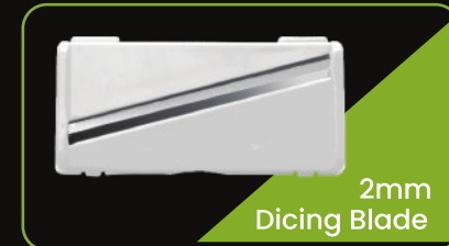
2mm Dicing Blade