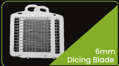
6mm Dicing Blade