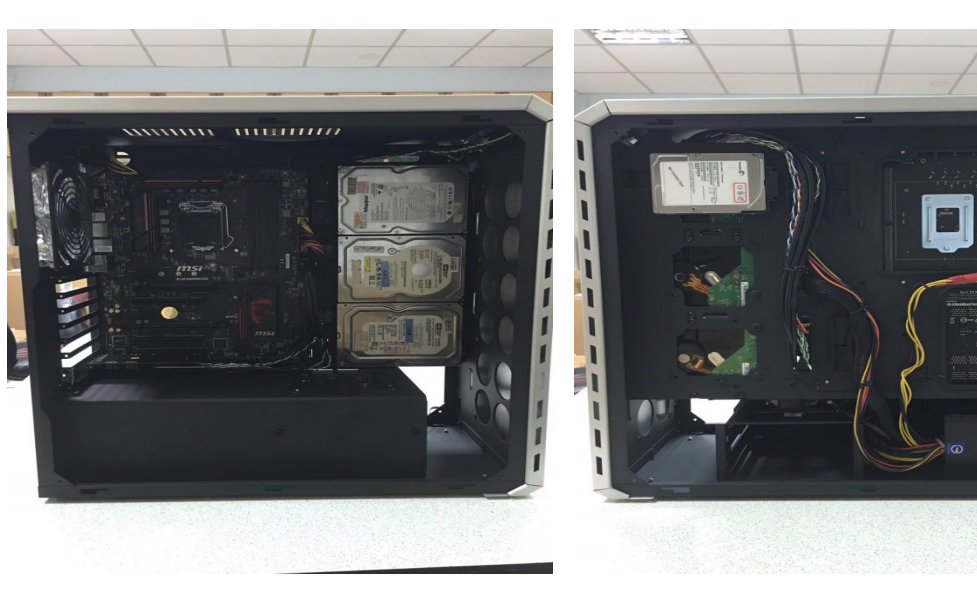
#Additional 3x 3.5"HDD on MB tray