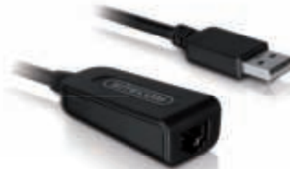
USB 2.0 Network Adapter