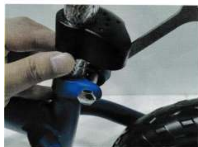
3. Tight the clamp.