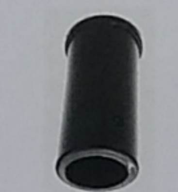
1.3. Hanger Body