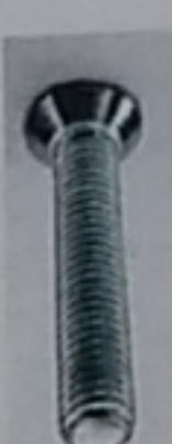
1.8. Hanger Holding Screw