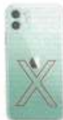
iPhone 12 series with non-magnetic protective case can't use it

2. iPhone 12 or other phones with non-magnetic protective case need to use the provided metal sheet.