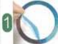
1 Tear off protective film

Attention! Must attach the metal sheet on the center of phone, otherwise it will get heated and stop charging, need to remove the metal sheet and attach it at right place.