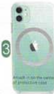
3 Attach it to the center of protective case