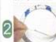
2 Tear off double faced adhesive tape